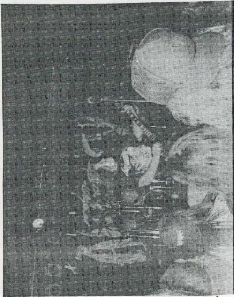
HEY! CHECK OUT THE GORGHITS SHIRT TALS AUTOPSY AXEMAN IS WEARING! PRETTY NIFTY, EH?